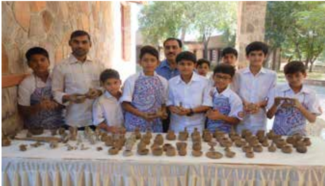
Pot the clay