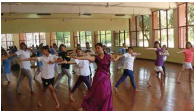
Dancing to glory