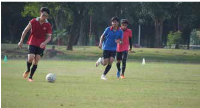
Friendship and football