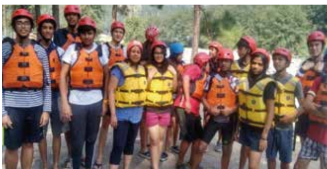
Dressed for water sports

the stars. We proceeded to the Hadimba temple followed by a photo shoot at the Rohtang pass at 13058 ft. The main objective to travel there was to trek on ice but unfortunately there wasn't any. We then advanced towards Solang Valley where we got the opportunity to experience paragliding. Rafting on the river Beas was exhilarating. While returning all we did was sit back and relish the wonderful moments that we had.