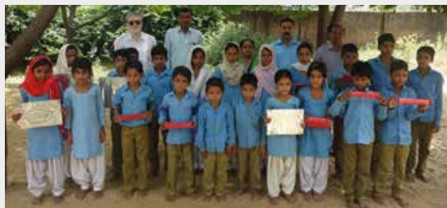
Encouraging the young underprivileged