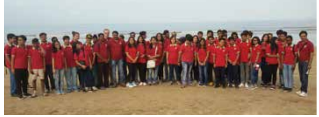
What fun together!