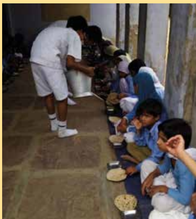
Serving a mid day meal