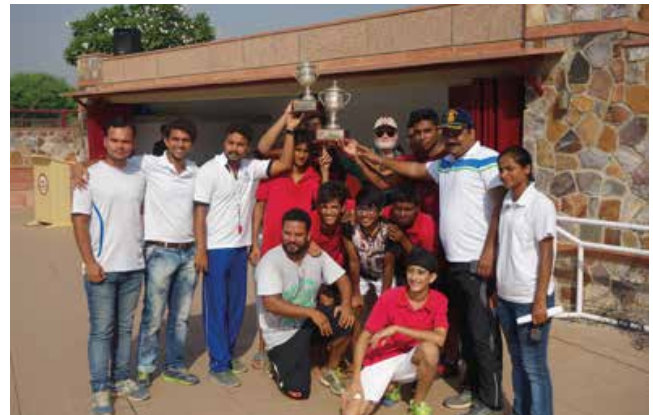
Ruby's the winner