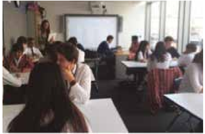
Attending a class at Lycee Francais