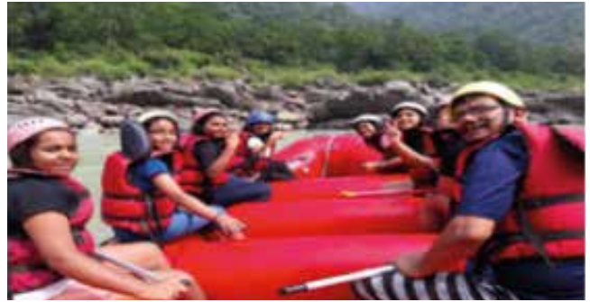
Taming the wild waters

The trip was one of the most exciting with the weather adding charm to the entire trip. It was an amazing one as we shivered and swam in the cold water of the Kempty falls. We also enjoyed boating at the Mussourie lake. The camp at Kanatal was a treat to our eyes as the tall and beautiful trees surrounded us with ethereal beauty. We set off for Rishikesh, driving all the way there. We trekked until the Patna waterfall for a refreshing dip in it. The much awaited activity of the trip was the rafting expedition of 12 kms in the Ganges. It couldn't have been more memorable as we crossed the rapids, bumping in the raft and did cliff jumping and even dived into the Ganges. All that we had once seen and read in the books turned out to be what we experienced in reality.