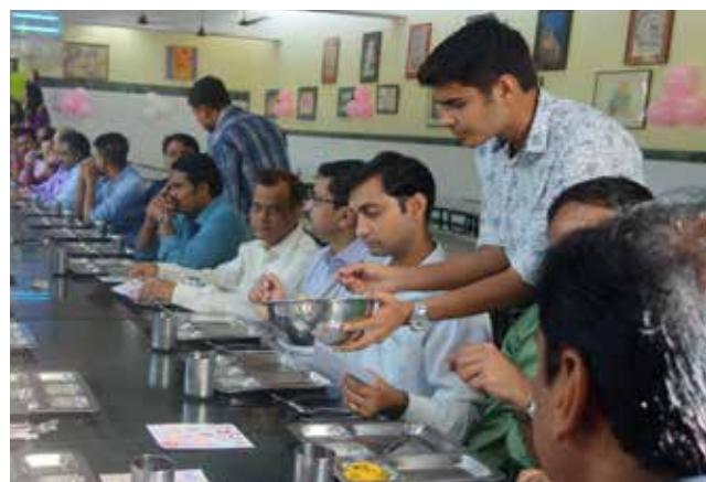
Serving the Gurus!

“Teaching is leaving a vestige of one self in the development of another. And surely the student is a bank where you can deposit your most precious treasures.”