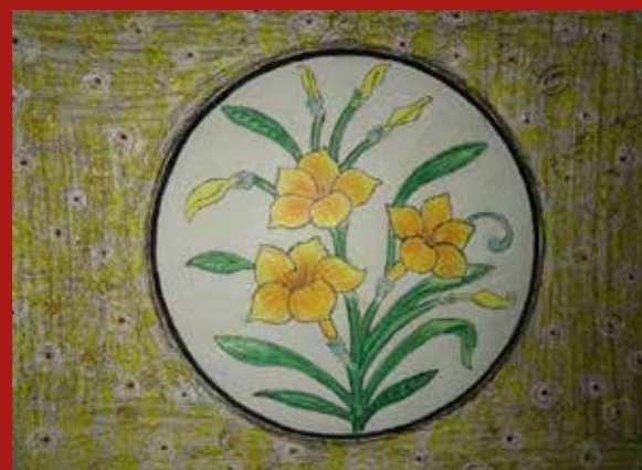
Sakshi class VIII