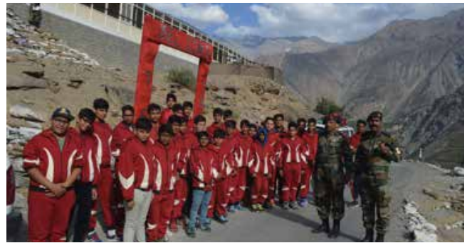
Army & Adventure