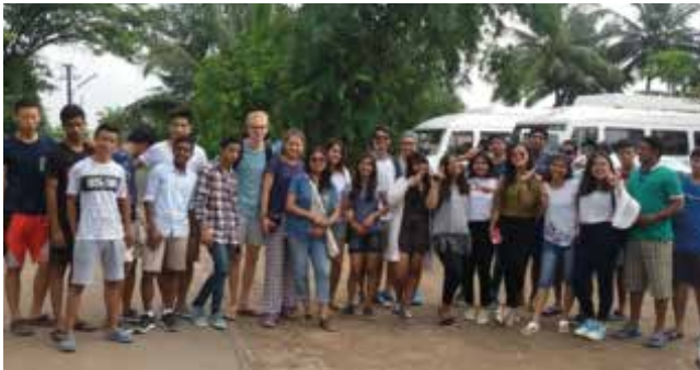
Mumbai – here we are!

It was my first ever flight and the very glimpse of the airport got butterflies in my stomach. We touched down at Goa and went off to the Varca beach. One can never resist seafood when at Goa. At Colava beach, the sound of the waves was mesmerising, we collected shells and captured these moments on camera. The cruise and the band were very enjoyable. The visit to the St. Francis Church and the famous Siddhivinayak temple of Mumbai followed. On our list next was the Gateway of India, the Essel world with its wonderful rides and the Elephanta caves which had the inscriptions from a bygone era. We shopped at the Bandstand and Colaba Causeway. It was one of the most enjoyable trips.