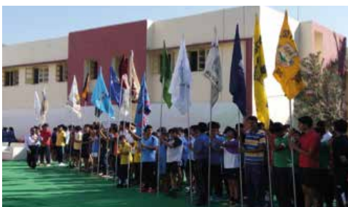
CBSE Cluster Table Tennis Tournament; October @ KVV, Chittorgarh