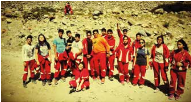
Hills & Thrills

stories motivated us. We also got to stay an extra day at the Army Base and brought back amazing memories. The most beautiful place that we visited was Sangla. The shopping at Shimla Mall road and Chandigarh summed up our trip.