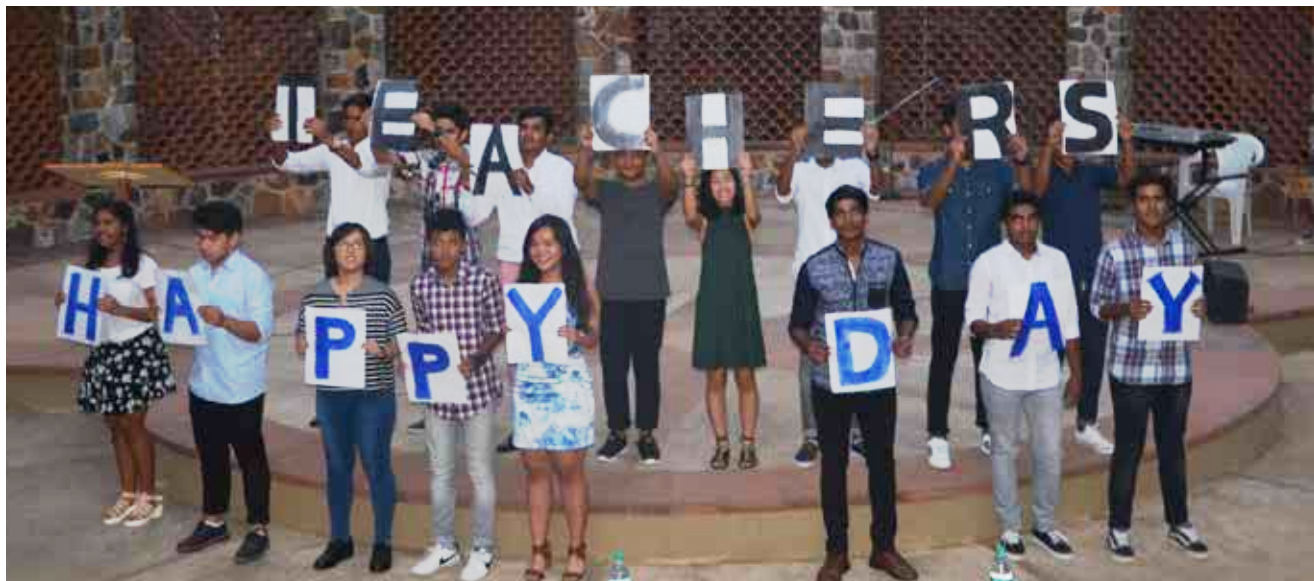
With love to Sir and Mam