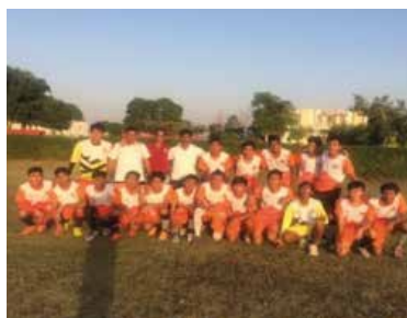
CBSE Cluster Football Tournament; October 19-22@ JD International, Jaipur