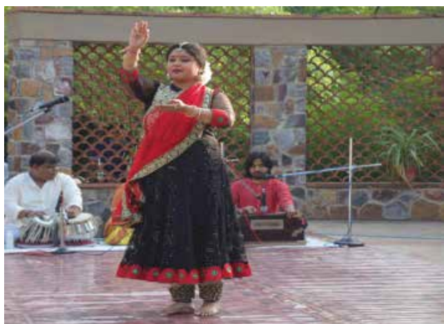
The ace of Kathak