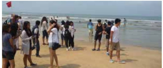
Sea n Sand