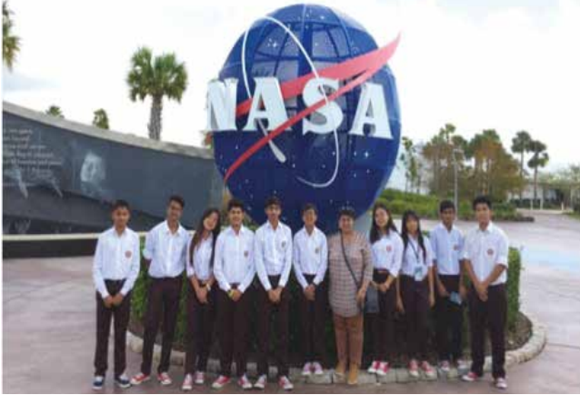
Sky is not the limit!