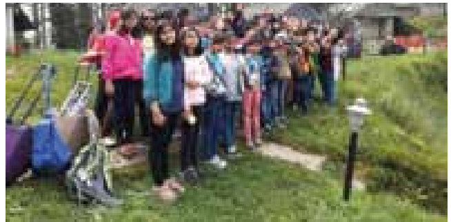
Nature at its best!