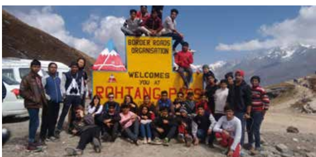
Touching the peaks