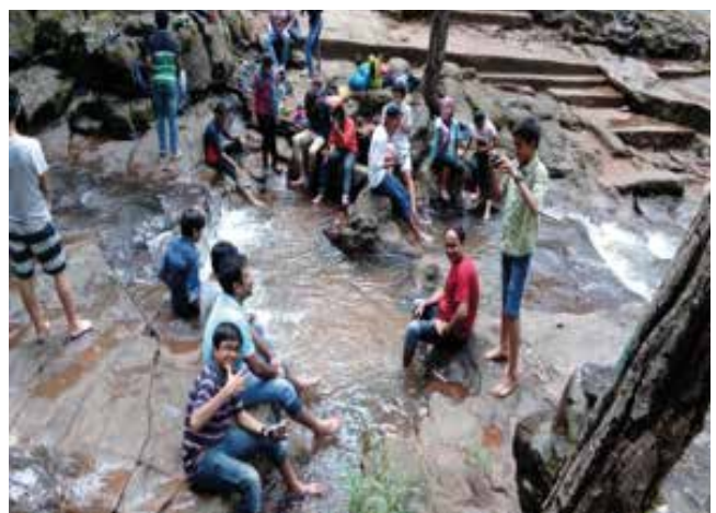
En route to the Bee Falls