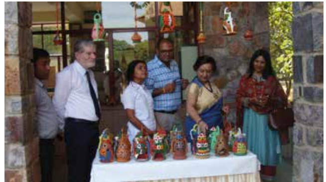
Wonderstruck - the dignitaries