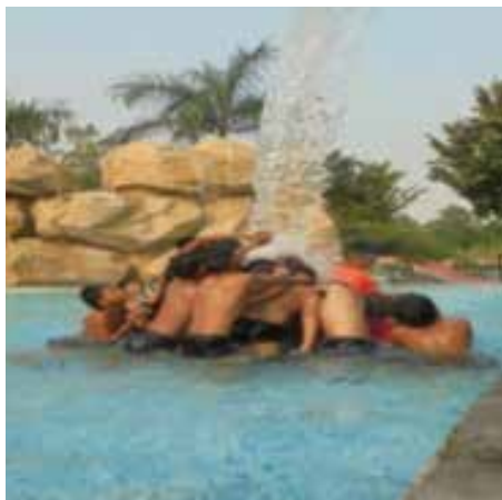
Wet & Wild!