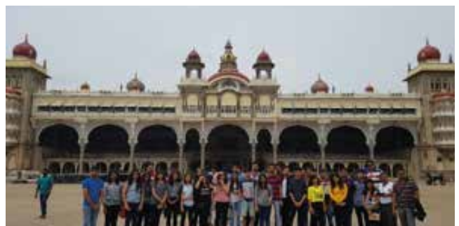
Memories to cherish!